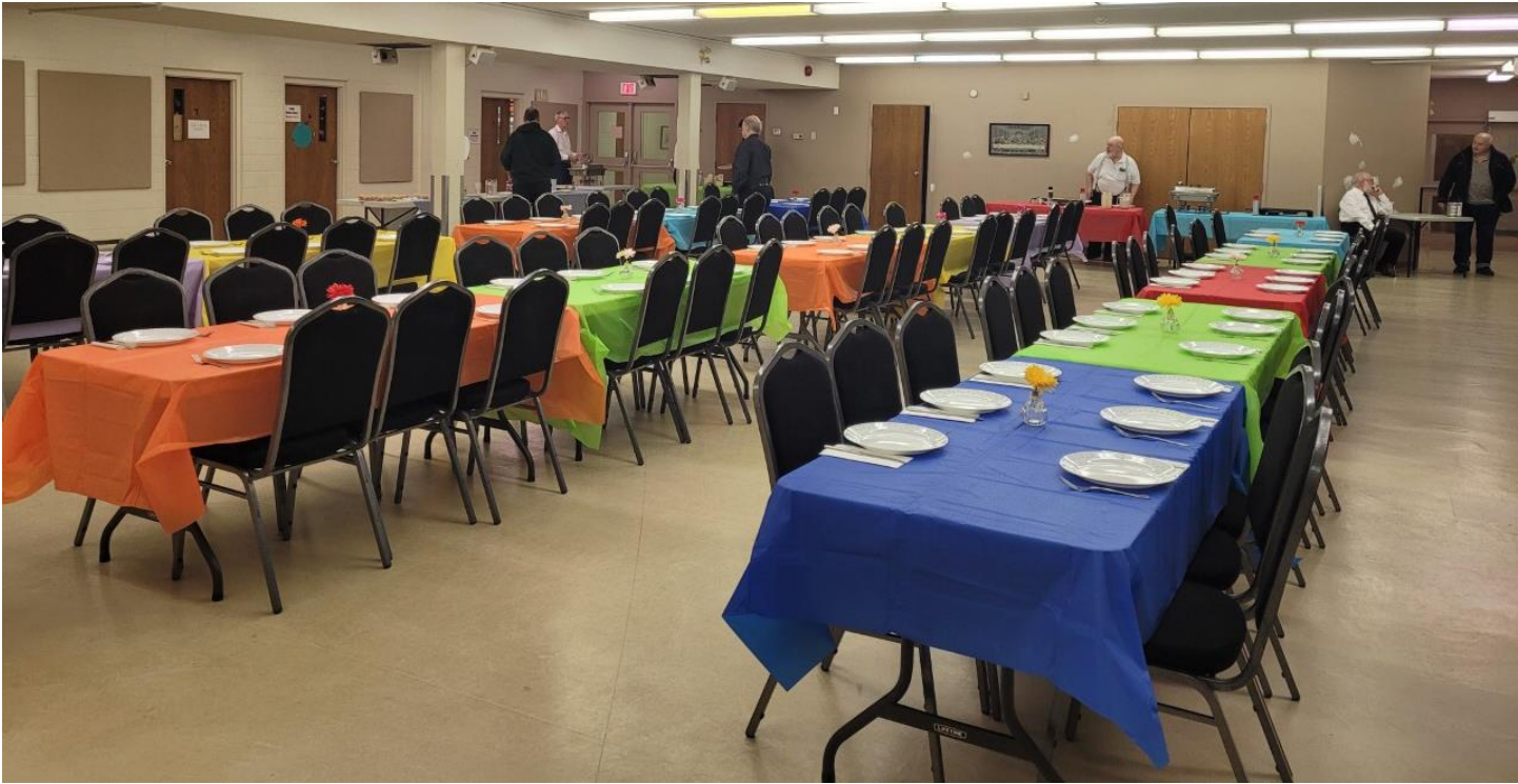
The Pancake Supper was a definite success - over 80 people attended this event!