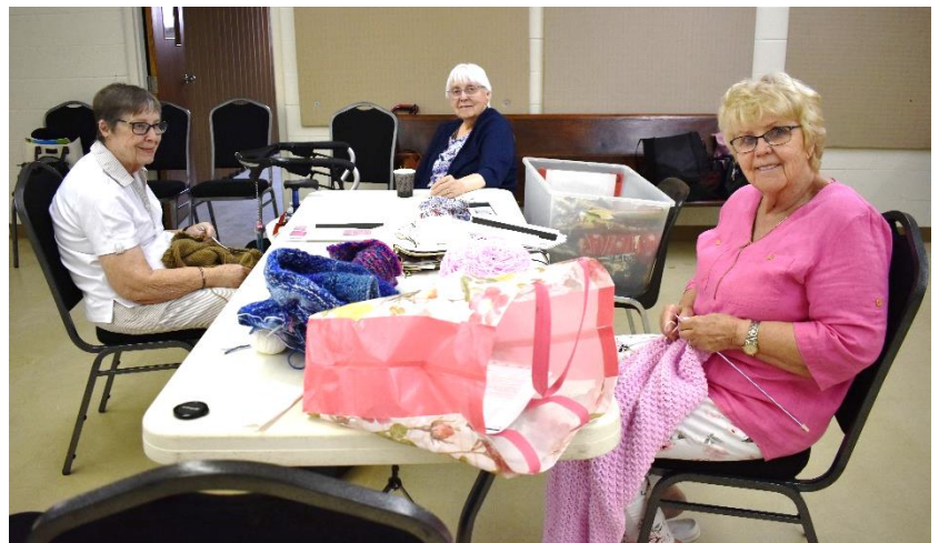
Ladies at the TMFG (Tuesday Morning Fellowship Group) on June 06