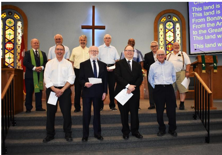
PVUC Men's Group church service for Father's Day