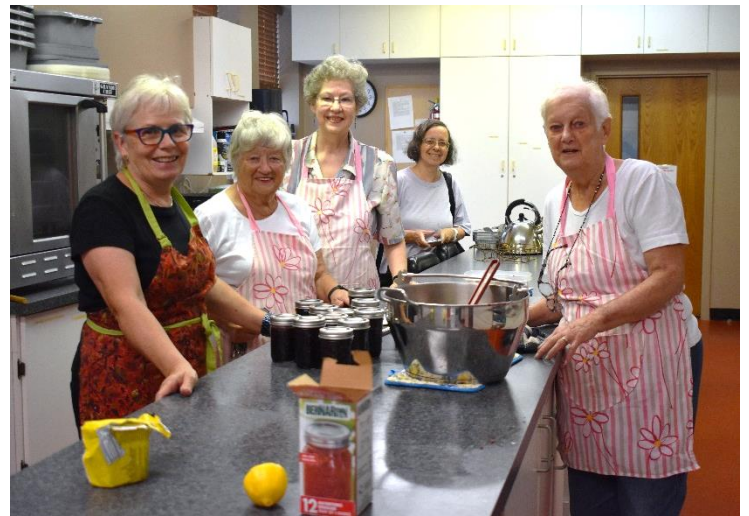
UCW ladies making strawberry jam in July to sell at the PVUC Christmas Market