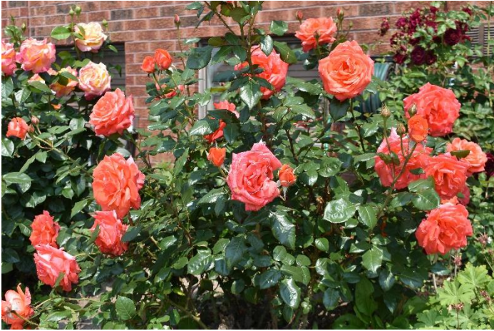
June roses in the PVUC gardens