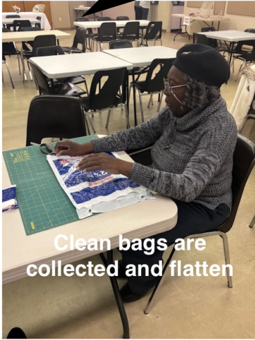
Clean bags are collected and flattened

..... • DID YOU KNOW that it takes 183 milk bags to complete • ONE mat. Child size - 27 x 40 - Frame size - 31 x 45 • Completed mats are taken to St. Andrews's Presbyterian • Church. The mats are then delivered to CANADIAN FOOD • FOR CHILDREN in many different countries. As well, they • are distributed to a variety of shelters for the homeless. • PVUC has been making these mats for many years.