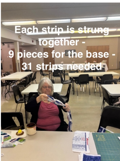
Each strip is strung together - 9 pieces for the base - 31 strips needed